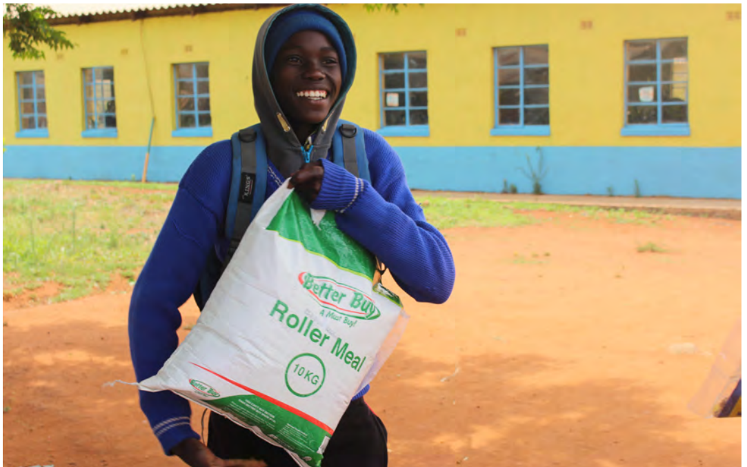
Photo 14 It is easy to smile when there is food for your family

Throughout the year, we provided essential support to 45 families who needed it most. The families received monthly food hampers. These hampers are carefully designed to meet the nutritional needs of families. They consisted of the basic necessities such as maize meal, beans and soap.