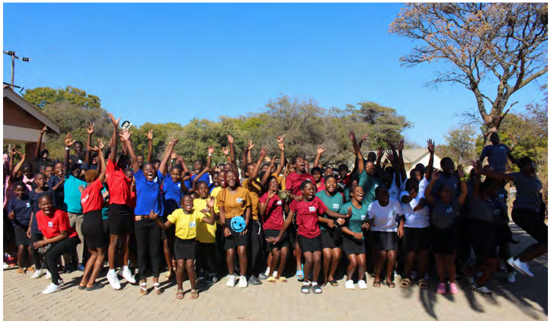
Photo 12 There is always joy and enthusiasm at the ATTIC Camp

The teams competed against each other in various activities, including sports, arts, and educational stations. The participants particularly enjoyed the educational stations, which are interactive and encourage them to be positive agents in their communities. The camp was a great opportunity for the teenagers to learn new skills, make new friends, and build self-confidence..