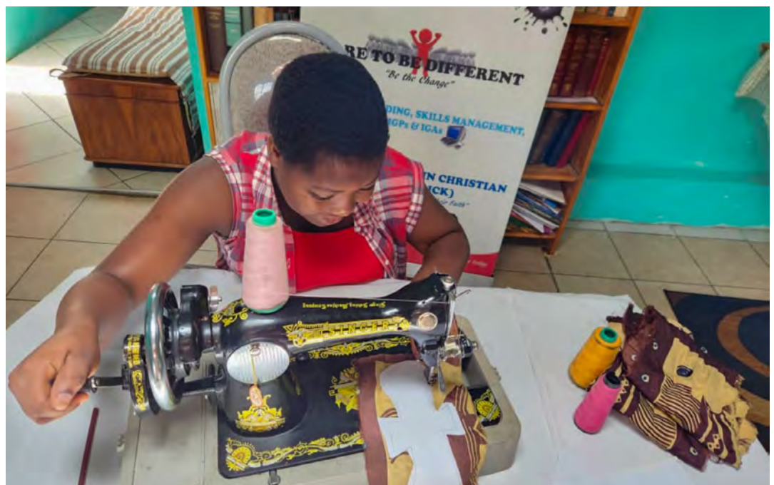
Photo 15 Sewing reusable pads

The issue of menstrual hygiene has been a significant concern, especially in poor rural communities. Limited resources, social stigma, and lack of access to proper sanitary products are some of the reasons why menstrual hygiene is a challenge. In response to this issue, sanitary pad drives have been organized. The program not only provides women and girls with sanitary pads but also raises awareness about menstrual health. Through the Sethule Skills centre, girls are taught how to sew/make reusable pads. A total of 440 reusable and disposable sanitary pads were distributed during the drive.