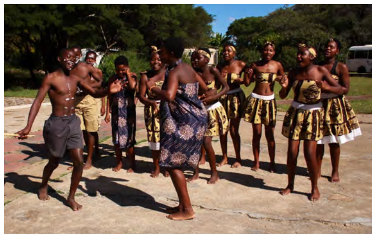
Photo 4 It is not all work at the SSC. Here Students are seen practising traditional dancing

This year the skills centre accommodated 21 students in a total of 3 sessions. Each session is a week-long and has unique curriculums that are designed to suit each particular group.