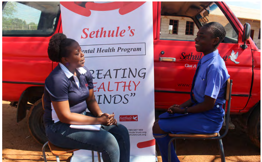
Photo 10 A Sethule counsellor having a one to one discussion with a student

This year, we reached out to a total of 1127 students. Extensive one to one counselling was offered to 6 students and 3 of these students were referred to further expertise assistance.