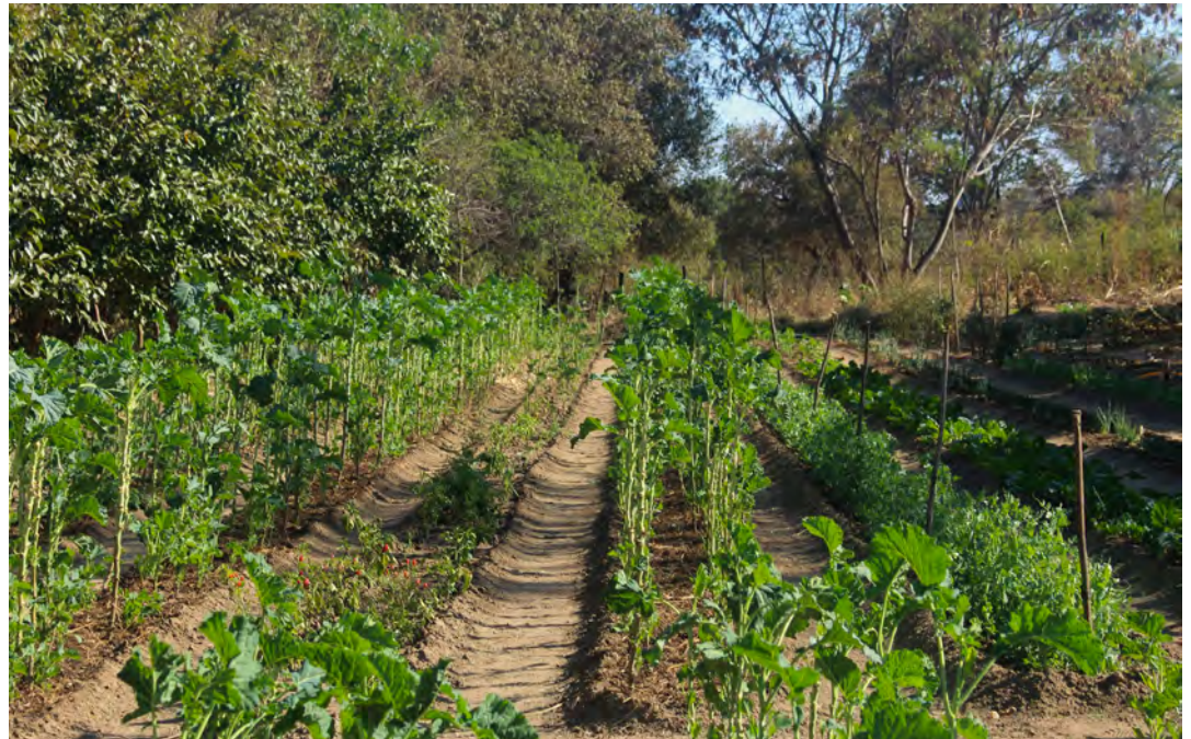
Photo 7 The Sethule garden showing off its lush produce

Our nutritional gardens have been thriving, providing a sustainable source of fresh fruits and vegetables for our community. We are particularly proud of the positive impact our gardens have had on our pre-school students. They have thoroughly enjoyed the fresh produce, which is essential for maintaining a well-balanced diet.