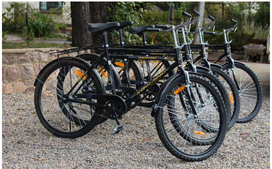
Photo 8 These bicycles were distributed to students

This year, we have been able to purchase 10 more bicycles, bringing the total number of bicycles to 33, distributed within 4 schools. We hope to reach even more schools and provide bicycles to more children in need.