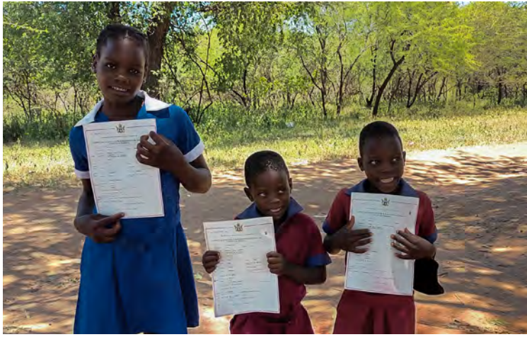
Photo 13 These children are happy to receive their birth certificate