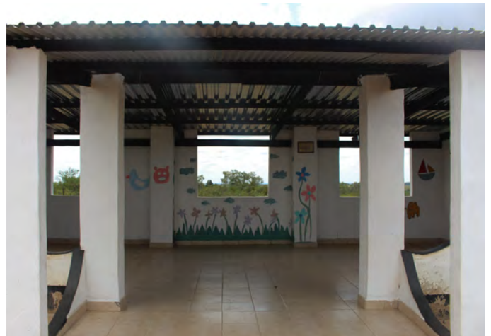
Photo 18 + 19 Classroom block almost completed and Hope Centre after Renovation