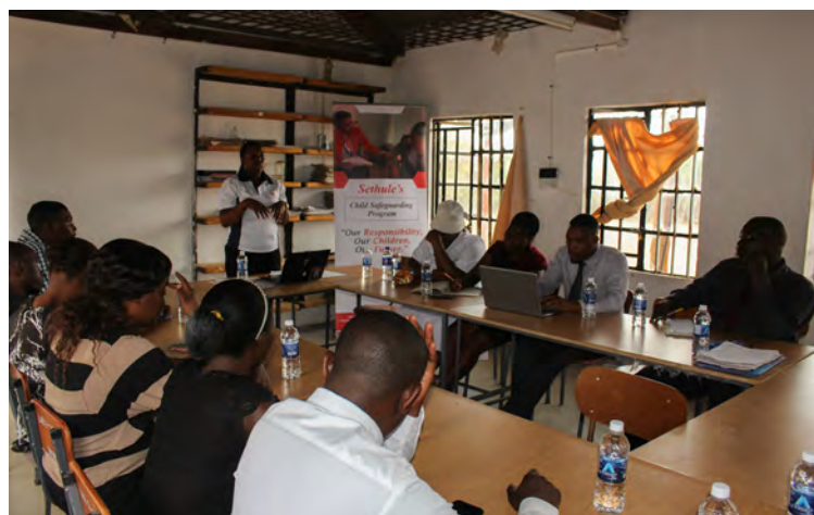
Photo 9 Teachers participating at a child safeguarding workshop for teachers