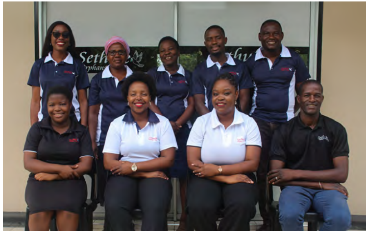
Photo 22 Part of the Sethule Staff members