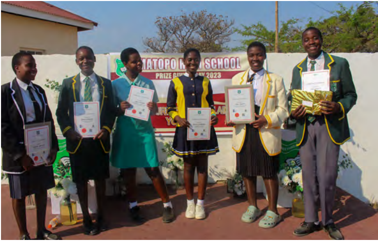
Photo 3 Our students were rewarded for achieving Academic excellence