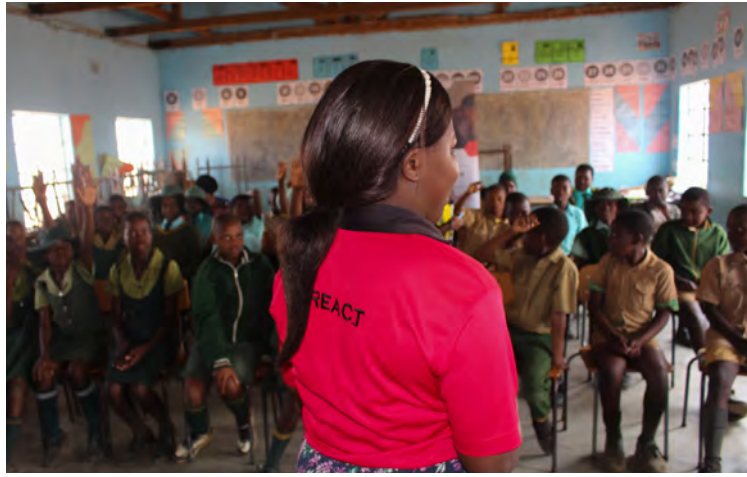
Photo 11 Our REACT lessons are fun and interactive